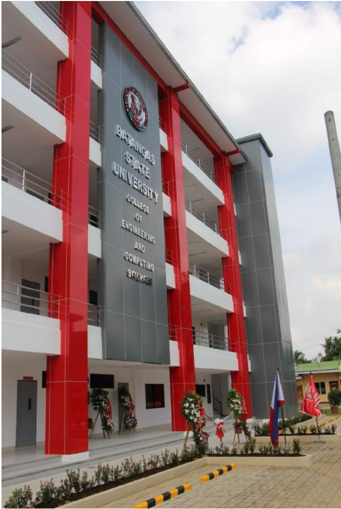
The CECS Building facade

remarkable event. After the inspirational message, the cutting of ribbon was led by the Municipal Mayor, BatStateU President and other University Officials.