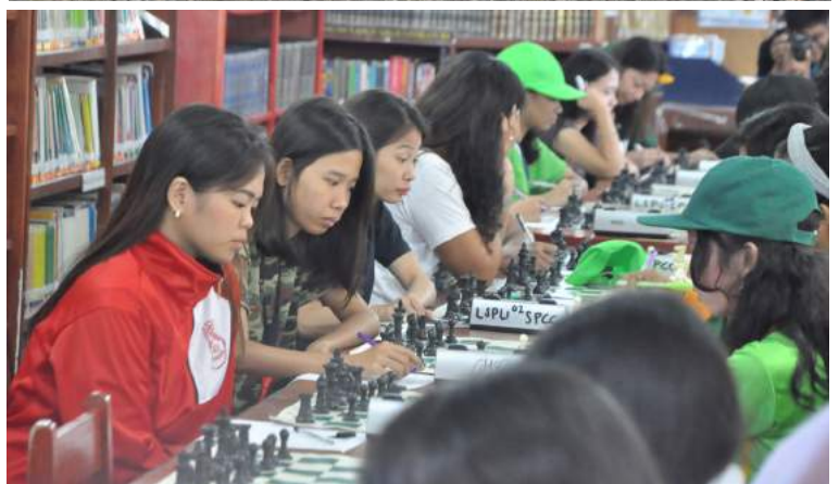
The Red Spartans in action during the STRASUC Sports Olympics 2017