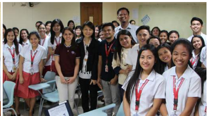
Sudents learn about the program offerings of National Sun Yat-sen University.