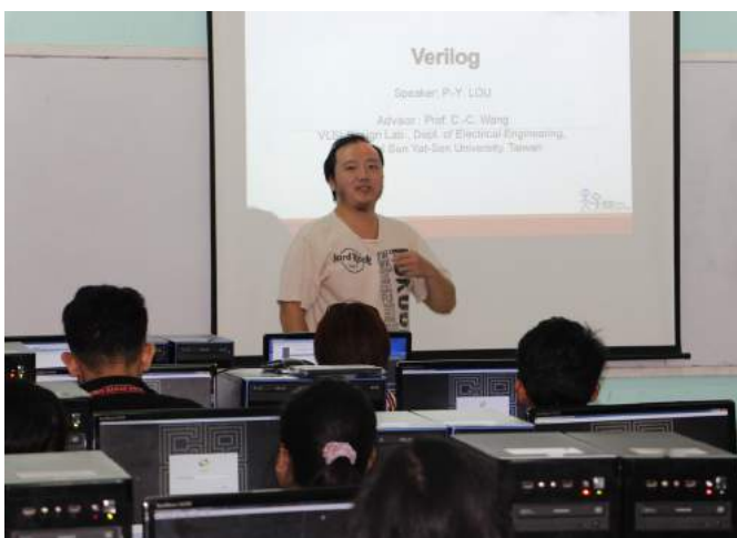
BatStateU students attend a crash course on Verilog.

the electronics and computer engineering programs of BatStateU and guests from partner industries attended the five-day technical workshop.