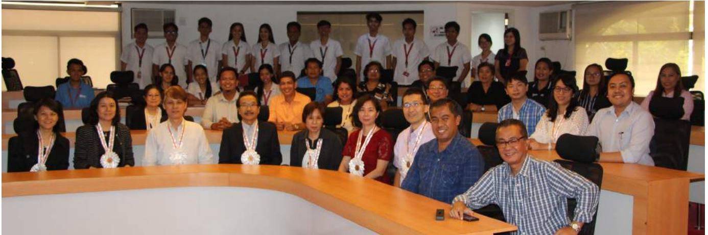
National Sun Yat-sen University delegates together with BatStateU officials, faculty members and students.

Delegates from National Sun Yat-sen University (NSYSU) in Taiwan visited Batangas State University to explore the possible areas of collaboration between both parties on October 27 at the Lecture Rooms 1 & 2, 2 nd Floor, CITE Building, BatStateU Pablo Borbon Main I, Batangas City.