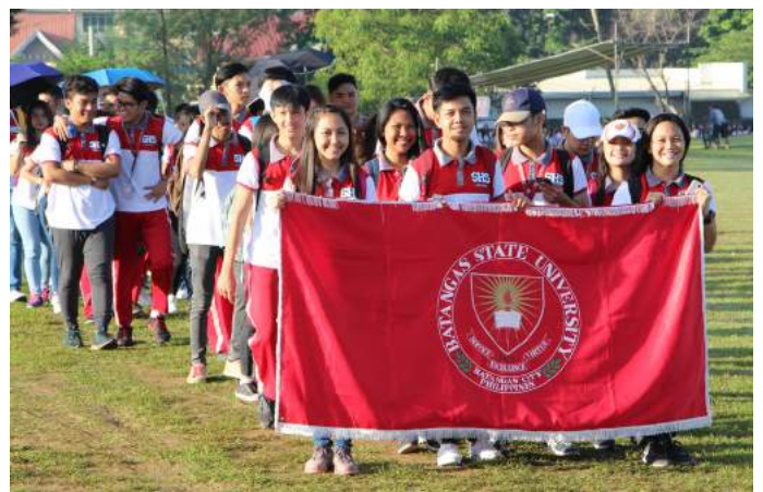
Highlights of the 2017 zumba and walkathon of the Alay Lakad Foundation, Inc. in Batangas