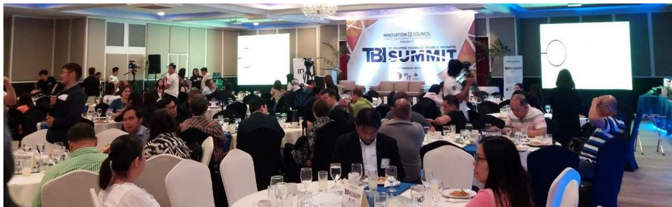
Networking and Working Lunch during the TBI Summit

Twenty new schools will be serving as TBI host institutions in the Philippines, namely: Adamson University, Bicol University, Bulacan State University, Cagayan State University, Cebu Institute of Technology-University, Holy Angel University, Iloilo Science and Technology University, Mapua Institute of Technology, Miriam College, Nueva Vizcaya State University, St. Louis University - Baguio, Technological Institute of the Philippines - Manila, Silliman University, Technological University of the Philippines - Visayas, University of Mindanao, University of San Carlos, University of Southeastern Philippines, University of Sto. Tomas, University of the Cordilleras, and the University of the Philippines Mindanao.