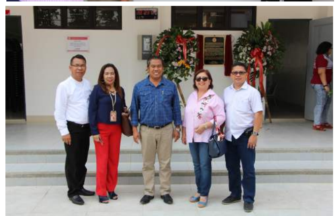
The BatStateU community joins the blessing of the CECS Building and the unveiling of its marker.