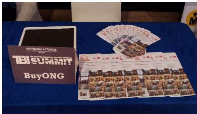
First batch of attendees were granted fundings to establish their TBIs (left); The BuyONG team set up an exhibit to showcase their start-up business (right).

Developed by the BatStateU CTI, BuyONG is a shopping platform that allows its users to buy groceries online, and pick up their orders by drive-thru. The start-up was the 2 nd place winner in the 13 th SWEEP (Smart Wireless Engineering Education Program) Awards for Innovation and Excellence held on February 15.