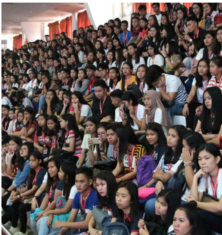
Students and parents gather at the gymnasium for the freshmen orientation