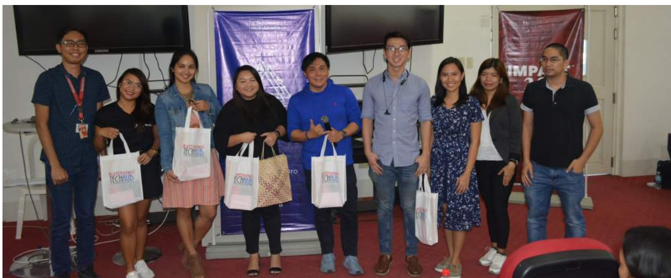
The speakers from Impact Hub Manila pose for a photo opportunity with the staff of the BatStateU CTI Office.

Selected BatStateU students, faculty, and professionals attended the said event.