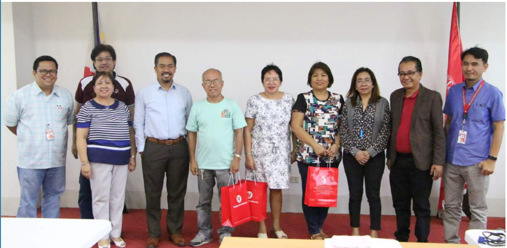
The retirees together with some of the members of the BatStateU Executive Committee.

At the end of the program, a token of appreciation was given to each retiree.