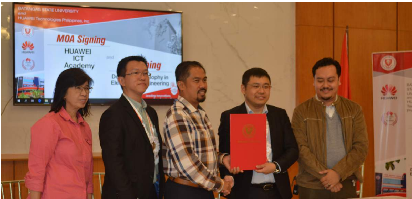
The officials present the signed memorandum representing the remarkable partnership between the BatStateU and Huawei.