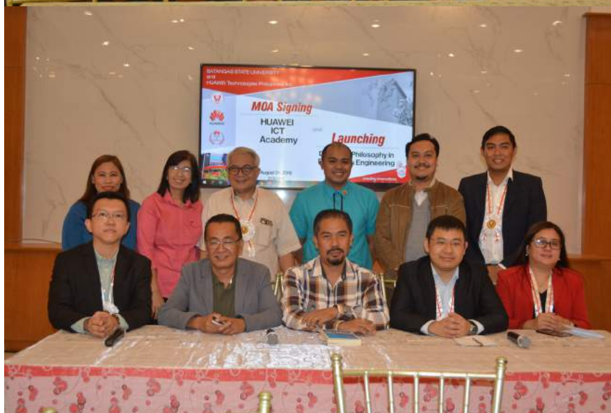
Students, Huawei officials and representatives, and BatStateU officials all grace the momentous event at the lobby of the newly inaugurated Higher Education Building.