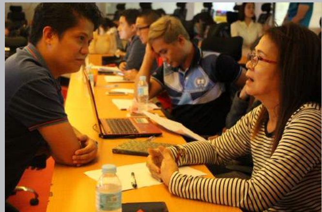
The participants share their ideas for the Ideation Session.