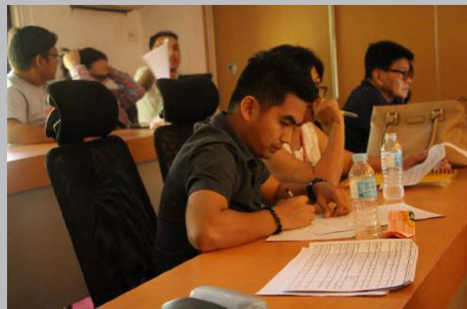
Staff from the Culture and Arts Office of BatStateU's different campuses gather at the Lecture Room to participate and brainstorm for the Ideation Session.