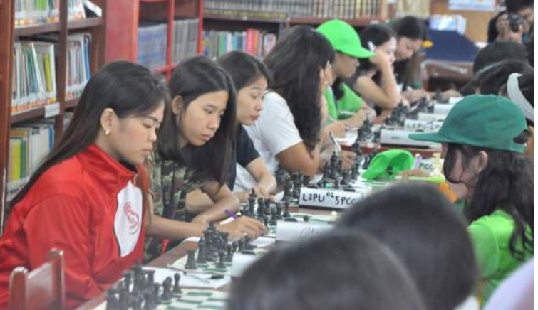
The Red Spartans in action during the STRASUC Sports Olympics 2017