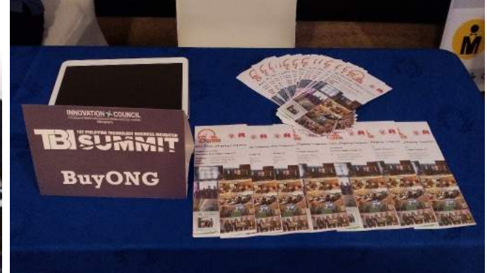
First batch of attendees were granted fundings to establish their TBIs (left); The BuyONG team set up an exhibit to showcase their start-up business (right).

Developed by the BatStateU CTI, BuyONG is a shopping platform that allows its users to buy groceries online, and pick up their orders by drive-thru. The start-up was the 2<sup>nd</sup> place winner in the 13<sup>th</sup> SWEEP (Smart Wireless Engineering Education Program) Awards for Innovation and Excellence held on February 15.