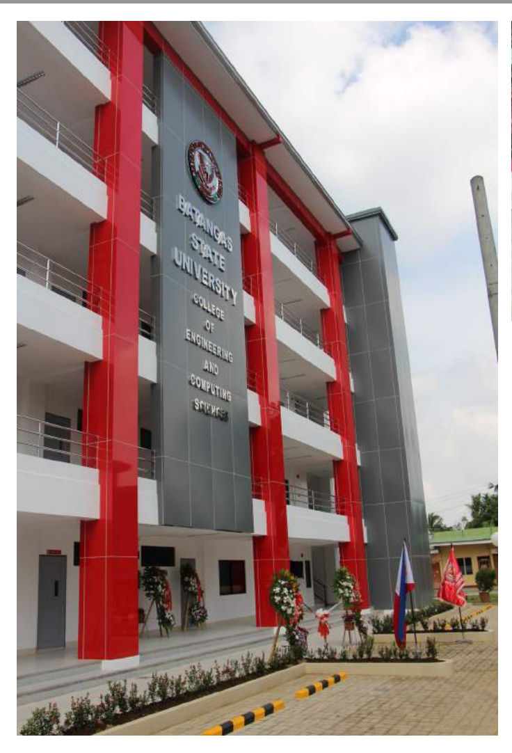
The CECS Bulding facade

remarkable event. After the inspirational message, the cutting of ribbon was led by the Municipal Mayor, BatStateU President and other University Officials.