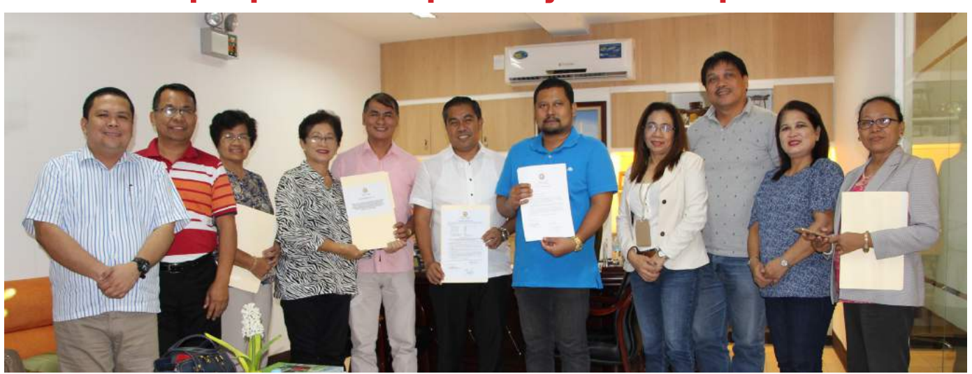
Members of the Academic and Administrative Couincils, and the Taysan Sanggunian Bayan present the signed resolution to establish a BatStateU campus in the municipality of Taysan.

The Academic and Administrative Councils of Batangas State University approved the establishment of an extension campus in the Municipality of Taysan, Batangas on November 3 during its joint meeting at the Amphitheater, 4th Floor, CITE Building, Pablo Borbon Main I.