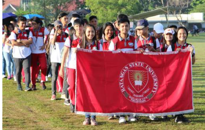
Highlights of the 2017 zumba and walkathon of the Alay Lakad Foundation, Inc. in Batangas