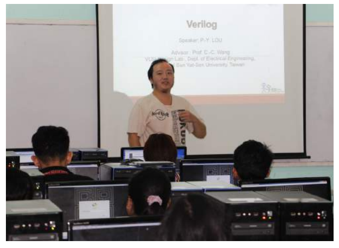
BatStateU students attend a crash course on Verilog.

the electronics and computer engineering programs of BatStateU and guests from partner industries attended the five-day technical workshop.