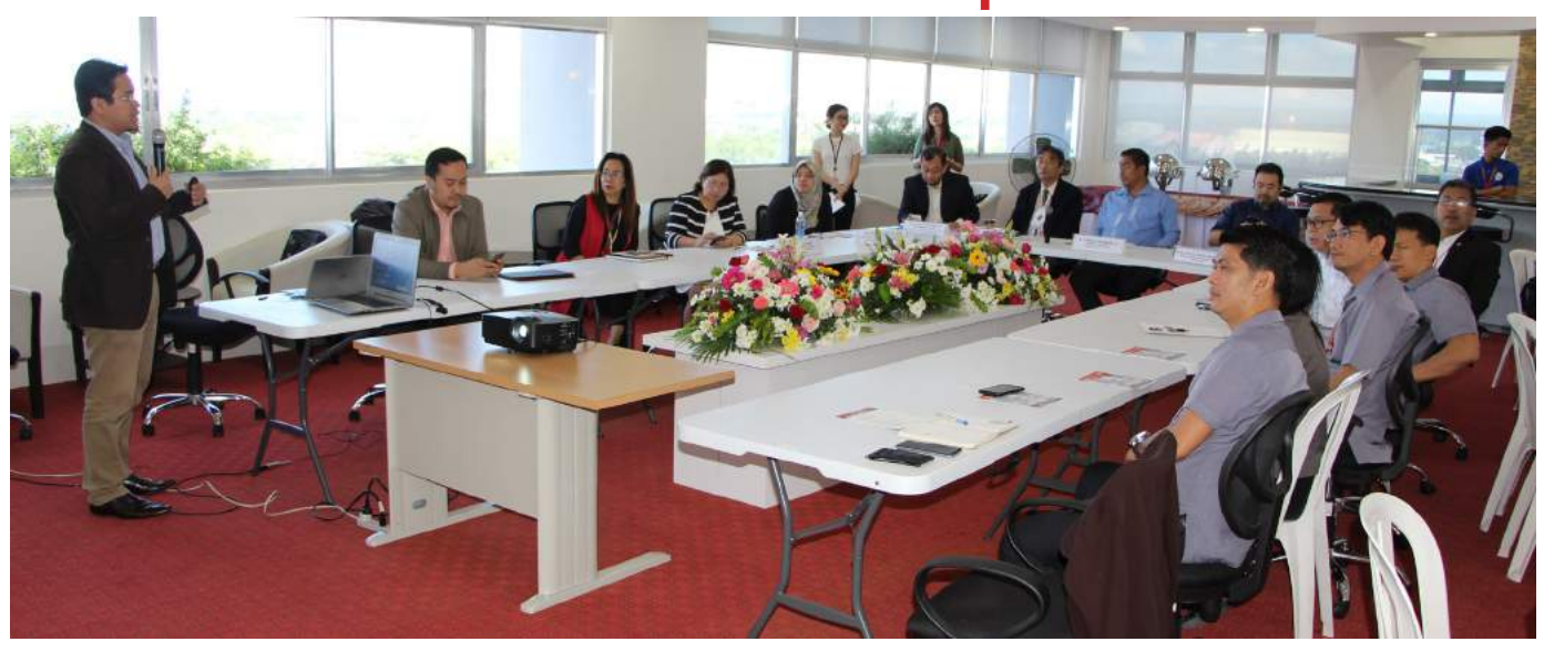
Universiti Teknologi Malaysia officials present their university's disaster risk management (DRM) initiatives to Batangas State University for potential partnerships in education and research.

Officials from the Malaysia-Japan International Institute of Technology (MJIIT) of Universiti Teknologi Malaysia (UTM) visited Batangas State University for a partnership meeting on November 14 at the Function Hall, 7th Floor, CALABARZON Integrated Research and Training Center, BatStateU Pablo Borbon Main I.