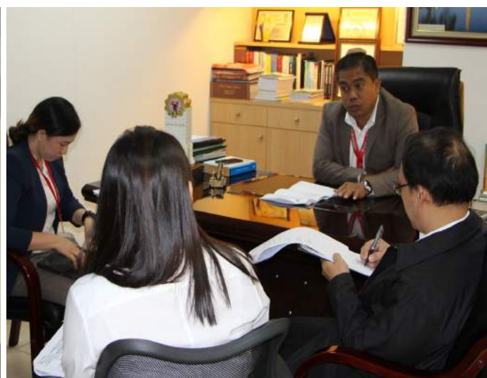
External Auditors from TÜV Rheinland Philippines conduct the Stage 2 Audit for ISO 9001: 2008 Certification at BatStateU's four campuses.

The Batangas State University surpassed the Stage 2 Audit for 9001:2008 Certification on December 19-20 in four BatStateU campuses: Pablo Borbon Main I and II, ARASOF Nasugbu and JPLPC Malvar.