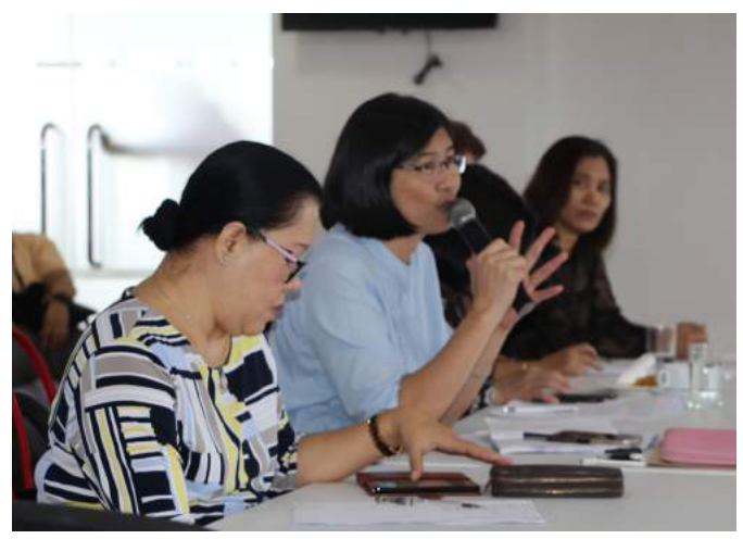
SUC presidents under STRASUC share insights on the MOU during the meeting with TNU.

Thai Nguyen University (TNU) in Vietnam and the Southern Tagalog Regional Association of State Universities and Colleges signed a Memorandum of (STRASUC) Understanding (MOU) on October 17 at the Conference Room, 7th Floor, CALABARZON Integrated Research and Training Center, BatStateU Pablo Borbon Main I, Batangas City. The said event aimed to strengthen cooperation between both parties in various areas that will