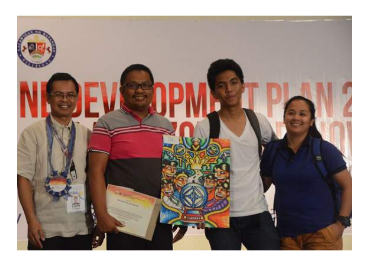
Awarding the winners of the High school postermaking contest

BatStateU co-sponsored the High School Poster-Making Contest (Junior and Senior High Categories) by providing coloring materials to the 36 participants from