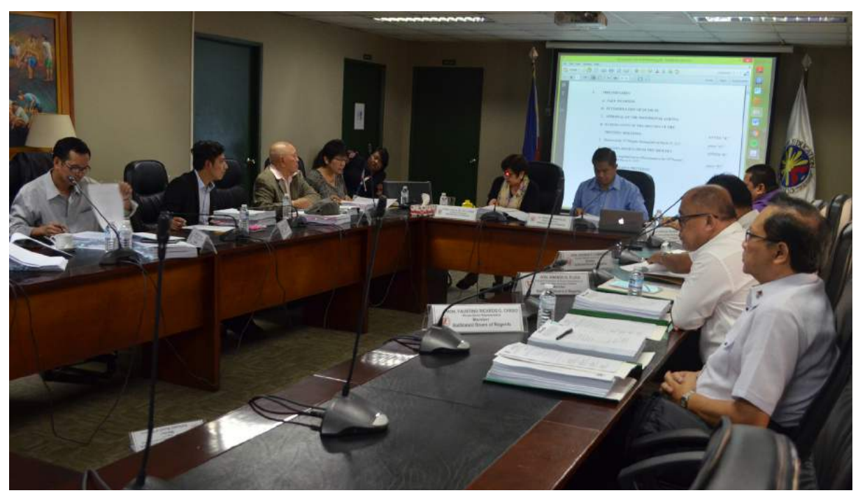
The BatStateU Board of Regents reviews and deliberates on the curricula of the proposed DREAM Academy, the first educational facility in Region IV-A to offer disaster risk management (DRM) programs.

The Batangas State University Board of Regents approved the establishment of the Disaster Resiliency Education for Adaptation and Mitigation (DREAM) Academy on July 13 during its 55th Regular Meeting.