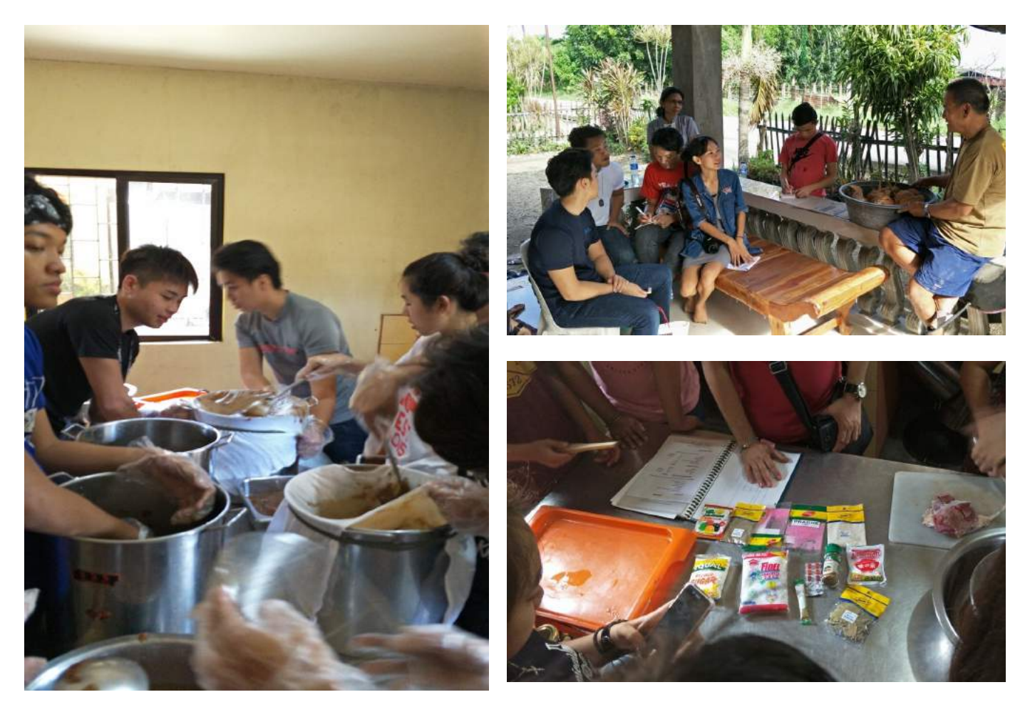
The students take part in the livelihood of their partner barangays, and conduct interviews with the residents to identify the needs of the community.

The experiences of the Singapore Polytechnic students with Learning Express allowed them to learn about the participating Filipino communities and BatStateU. It also served as a venue to build networks and friendships with their local counterparts.