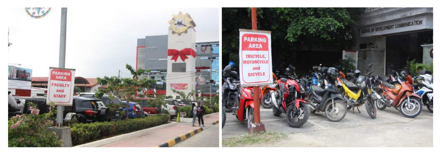
Two of the designated parking areas in BatStateU Main I are located in front of the Tower of Wisdom (left photo) for use of faculty and staff; and beside the Audio Visual Building for tricycles, motorcycles, and bicycles (right photo).

Recognizing the existing concerns on parking and traffic within the campus, and the possible risks on safety and security that may arise, the University administration implemented the new traffic management plan in BatStateU campuses on August 7.