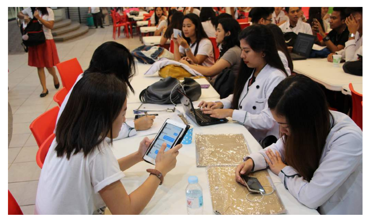
Students enjoy the faster WiFi services within the BatStateU after ICT implemented its Internet upgrade project.

The project is a part of the BatStateU Investment Plan FY 2015-2018 to achieve a smarter campus.