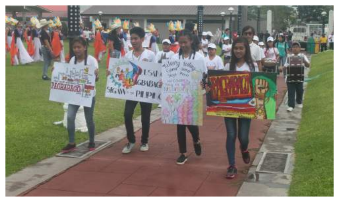
Students from different public schools in Batangas City during the Roadshow parade

Batangas State University joined the National Economic Development Authority (NEDA) IV-A in its the Philippine Development Plan (PDP) CALABARZON Roadshow themed "Tayo nang Abutin ang Ambisyon Natin" on July 28 at the Batangas Provincial Capitol. As part of the communication plan of the PDP, the Roadshow aimed to generate interest