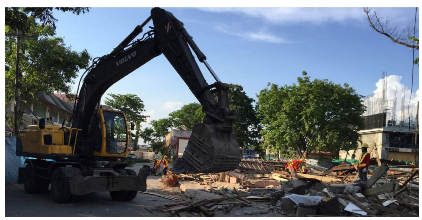
A backhoe demolishing the Old Administration building to give way to new University structures.

The Old Administration Building, the University Canteen and classrooms for Drafting were demolished to give space for parking in the University. Moreover, the space is intended for the future University Park and University Marker.