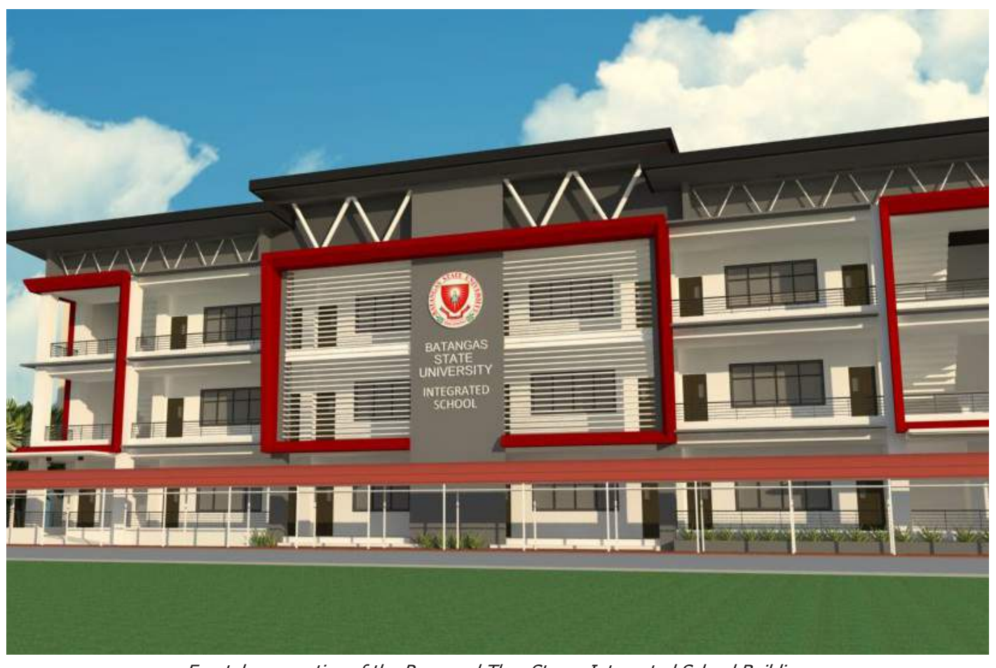
Frontal perspective of the Proposed Thre-Storey Integrated School Building.

True to its commitment of providing every learner a conducive learning-teaching environment, the university is constructing a three-storey Batangas State University – Integrated School (BatStateU-IS) building at Pablo Borbon Main I, Rizal Avenue, Batangas City.