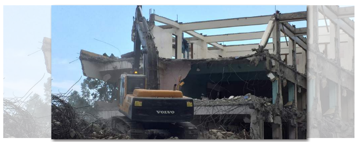
The old College of Industrial Technology Building in BatStateU Main II Alangilan being demolished to give rise to a new building for research.

Aside from the development in the Main Campus, other campuses also have Infrastructure Development projects with more than 40 Infrastructure Development projects in Batangas State University System.