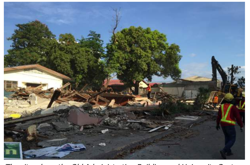
The site where the Old Administration Building and University Canteen were located.

Included in the Investment Strategic Plans is the and Development of Infrastructure to sustainable development relevant to the four-fold mandate-Instruction, Research, Extension, and Management of Resourcesfor global competitiveness. On April 2016, different demolition projects paved the way for the modernization of Batangas State University in all of its campuses.