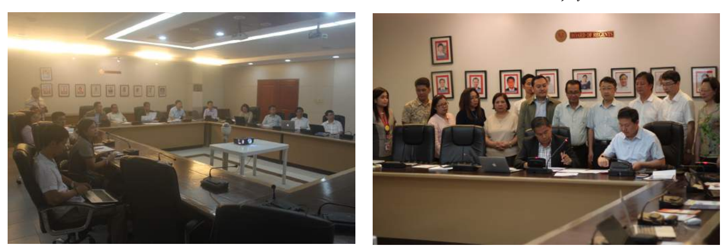
Batangas State University and Ocean University of China Officials during the signing of Memorandum of Understanding