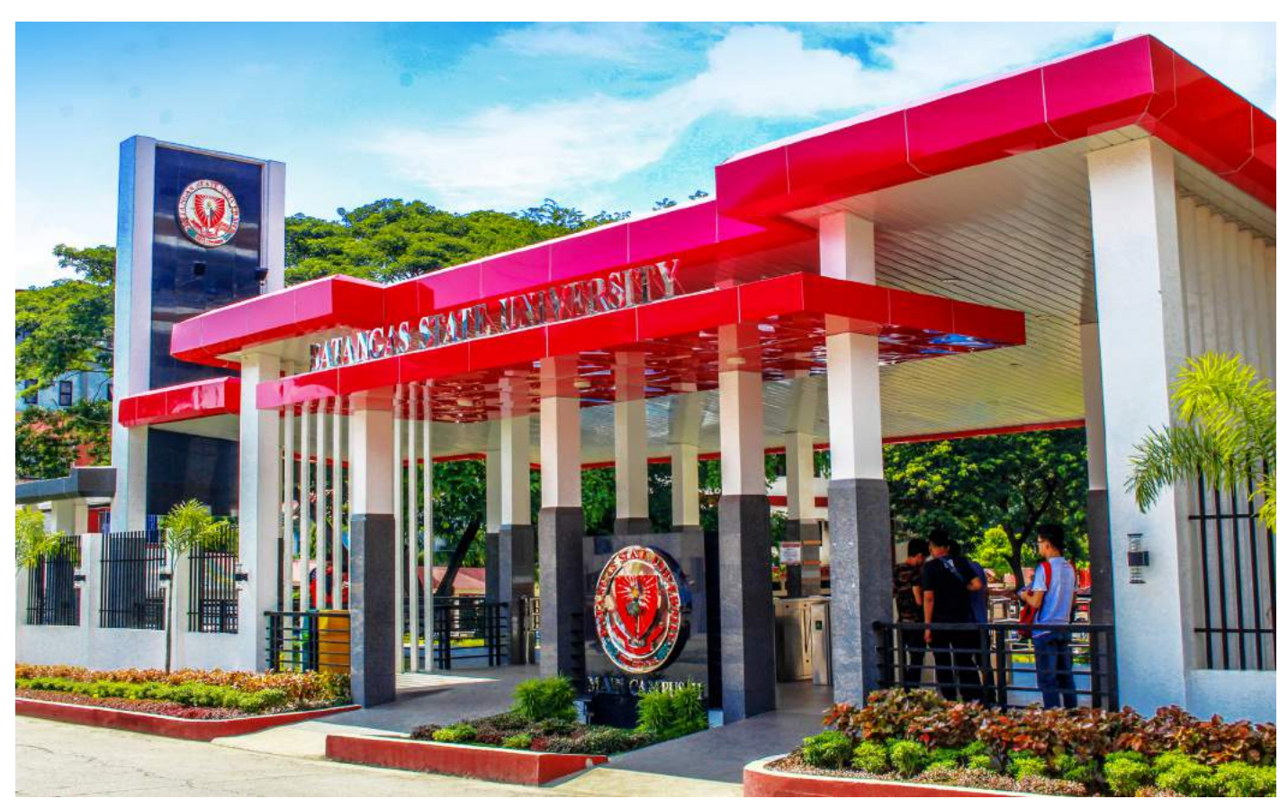
BatStateU Pablo Borbon Main II Façade