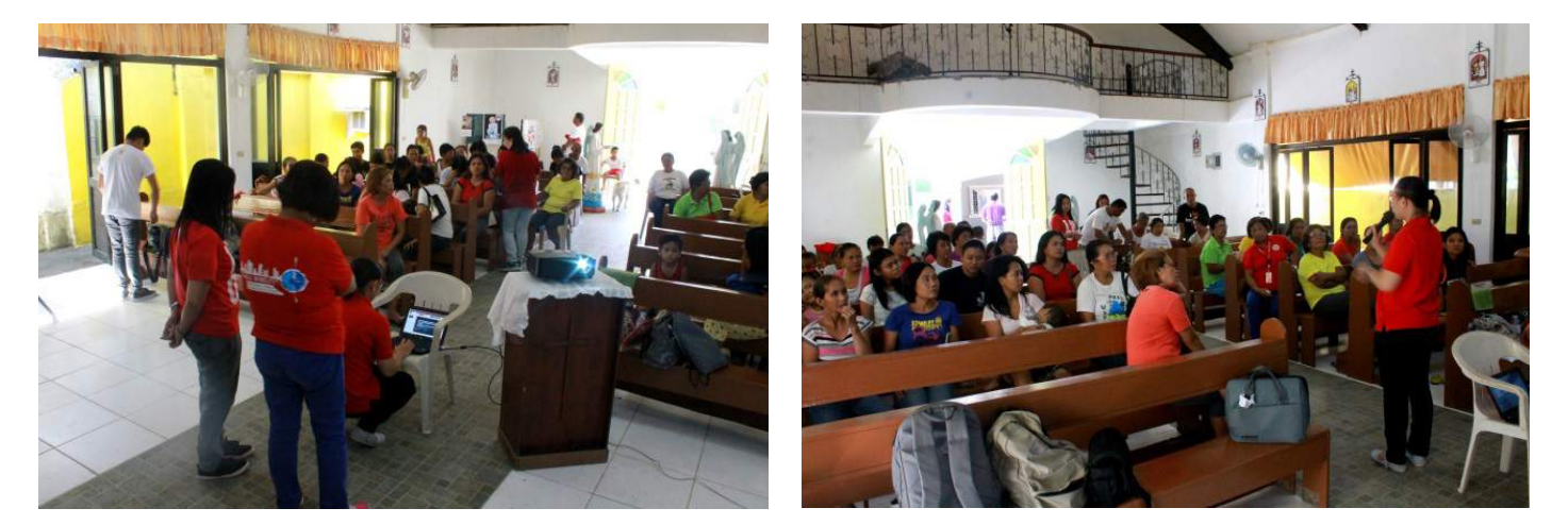
The extension organizers and the participants during stress debriefing

Batangas State University – Extension Services in coordination with College of Arts and Sciences (CAS – Psychology Department) conducted an extension activity Critical Incident Stress Debriefing (CISD) for 153 women and children of Barangays San Teodoro, Bagalangit and Ligaya, Mabini, Batangas on April 19. The said activity is one of the eight (8) components of the project LARGA Mabini (Lindol Adaptation and Recovery with Geo-hazard Assessment for Mabini).