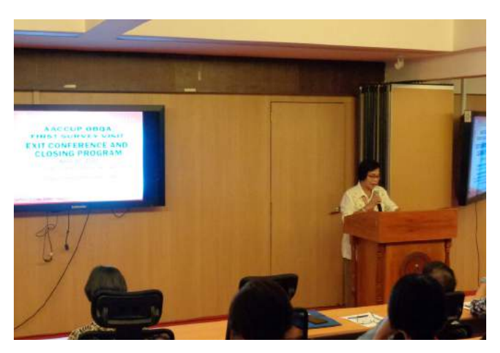
The AACCUP OBQA First Survey Visit, Exit Conference and Closing Remarks

At the exit conference, one of the strengths mentioned by the accreditors was the transformation of the Main Campus. As stated, "the total face-lifting, by the blooming of various structures in the Main Campus and so with the other campuses, shows a worthy and splendid support of those in close administration of BatStateU – from the Board of Regents, the President, the Academic and Administrative Councils, students and the stakeholders." There were also areas mentioned by the accreditors that need improvement as they also expressed recommendations for the improvement of the programs.