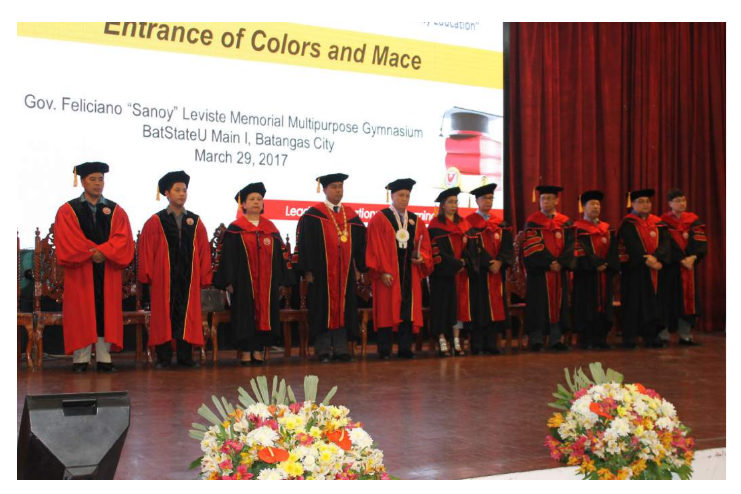
The Board of Regents (BOR) together with the Guest of Honor and Speaker in the 49th Commencement Exercises

the achievements and the accomplishments of BatStateU before the guests and parents of the graduates. From the programs accredited by the local and international accrediting bodies, CHED recognition to its various programs, board examination topnotchers, to the completed and ongoing infrastructure constructions in different