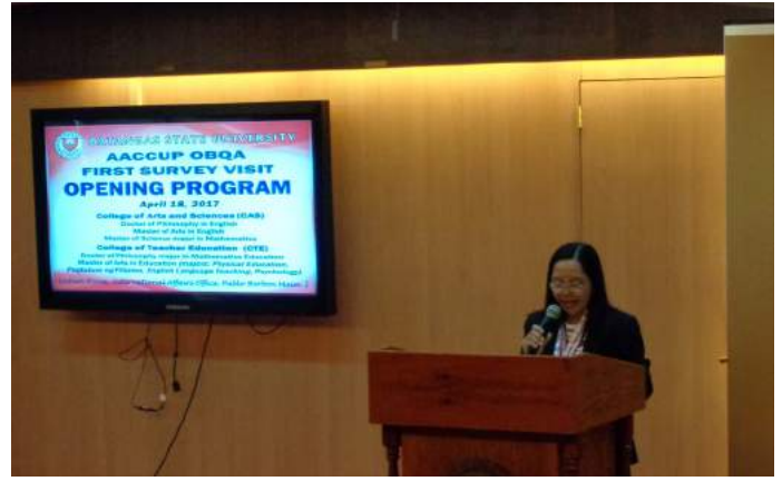
During the opening program of outcomes-based accreditation first survey visit.

The Accrediting Agency of Chartered Colleges and Universities in the Philippines (AACCUP) held an outcomes-based accreditation (OBQA) first survey visit for five (5) graduate programs of Pablo Borbon Main I on April 18-20.