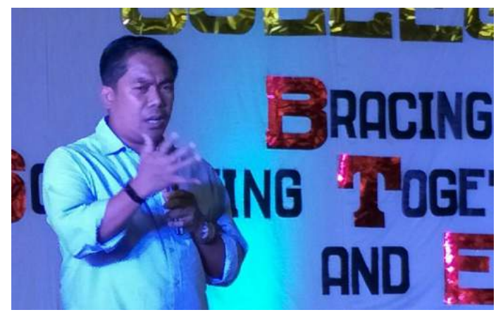
President Tirso A. Ronquillo delivering his message at the Inauguration of BatStateU - Rosario Campus' Finished Projects

The Student Services Center is located at the south east corner of the campus with an approximate floor area of 186.5 square meters. The building is fully furnished and utilized by different offices such as the campus clinic and speech laboratory, Guidance and Counselling Center, IACEPO, Scholarship, Alumni Affairs and Publication. The Sports and Culture Office, MAPEH