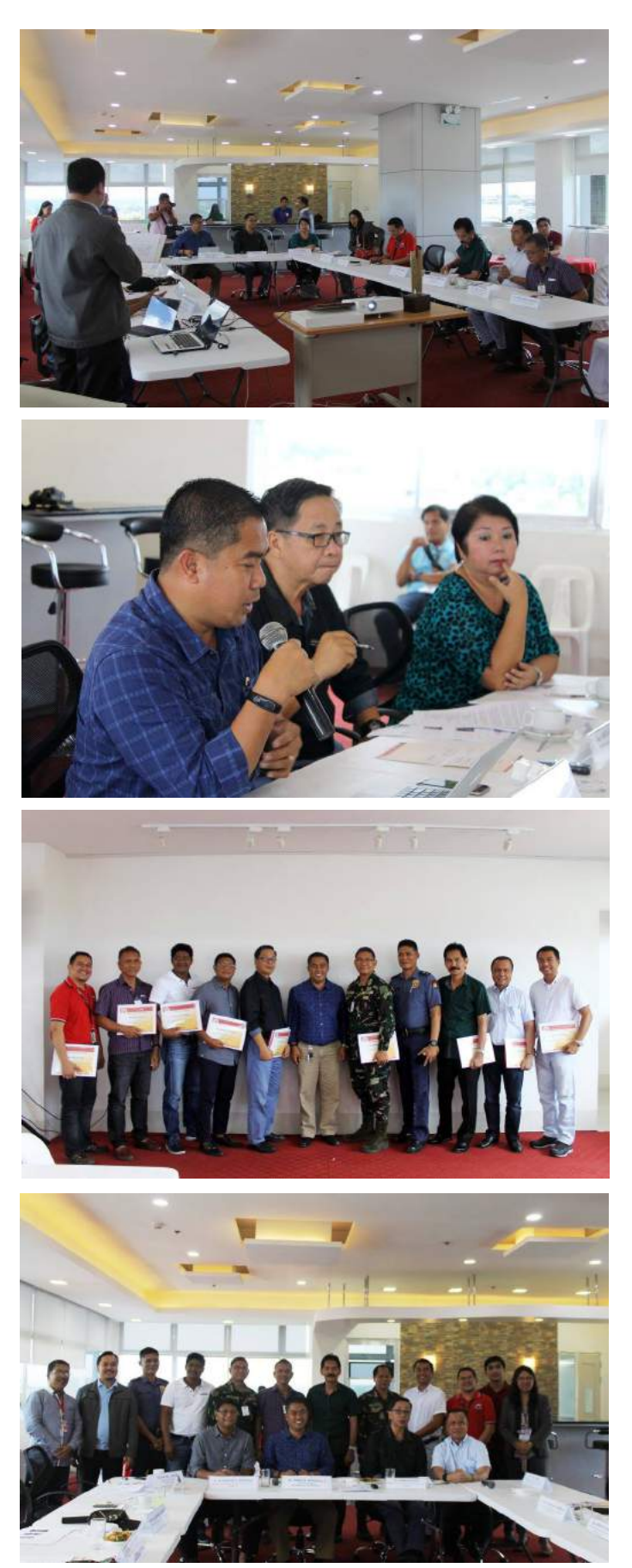
Multi-Sectoral Advisory Council (MSAC) MOA signing for BatStateU ACTION center highlights.

The formation of a Multi-Sectoral Advisory Council (MSAC) ensures the sustainability and viability of the University's training and research center for DRRM, the Adaptive Capacity-Building and Technology Innovation for Occupational Hazards and Natural Disaster.