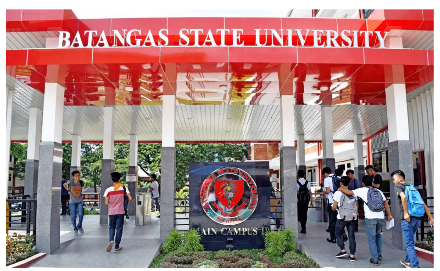
BatStateU Pablo Borbon Main II Façade