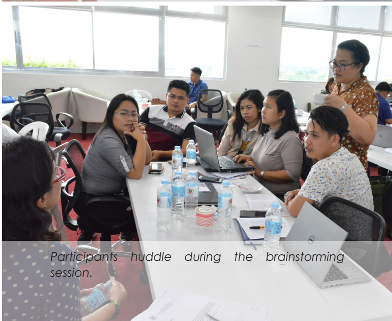
Participants huddle during the brainstorming session.