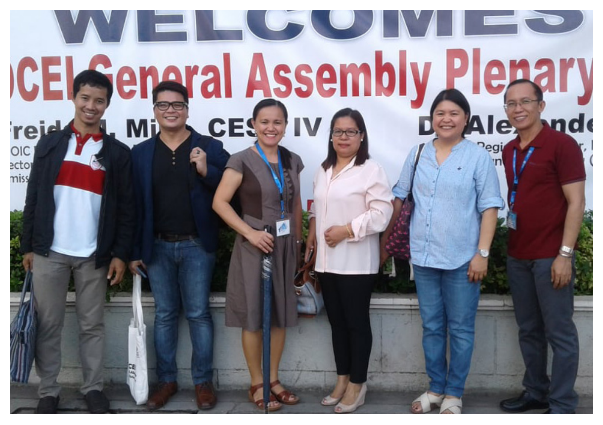
BatStateU research officials gather for a photo op at the 2019 NOCEI General Assembly

The 2019 Network of CALABARZON Educational Institutions, Inc. (NOCEI) General Assembly with the theme, "Industry 4.0 in the Academe: Innovating the Future," was held on July 19 at the University of Perpetual Help System Laguna PAT, Biñan City, Laguna.