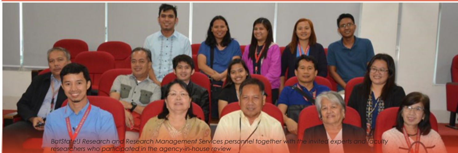
BatStateU Research and Research Management Services personnel together with the invited experts and faculty researchers who participated in the agency-in-house review

The second batch of the 2019 Agency In-House Review was conducted in BatSateU on September 18 at Pablo Borbon Main I.