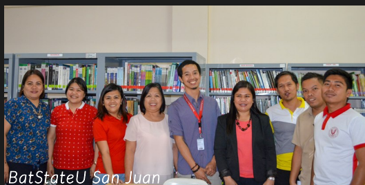
BatStateU San Juan