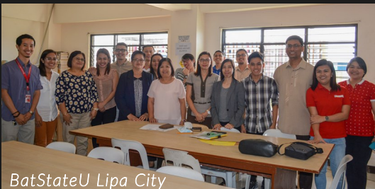
BatStateU Lipa City