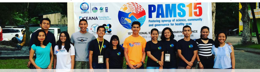
VIP CORALS focal persons, faculty researchers, and research assistants at the PAMS15

The 15th National Symposium on Marine Science (PAMS15) was held on July 4-6 at Aklan State University, Banga, Aklan, with the theme "Fostering synergy of science, community, and governance for healthy seas."