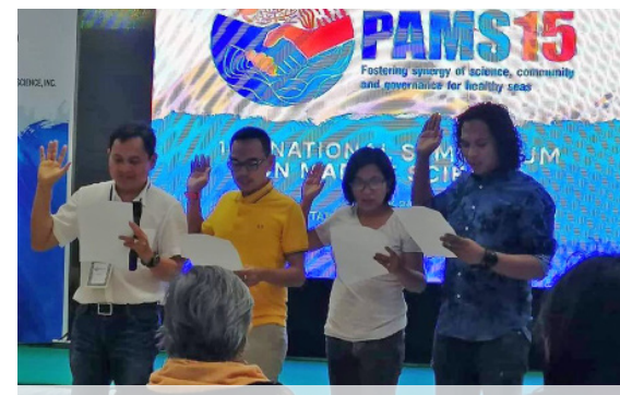
Oathtaking ceremony of the newly elected officials of the Philippine Association of Marine Science (PAMS)

The election was also a significant part of the 15th National Symposium on Marine Science (PAMS15).